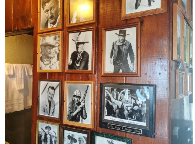
Famous Visitors Tribute Wall