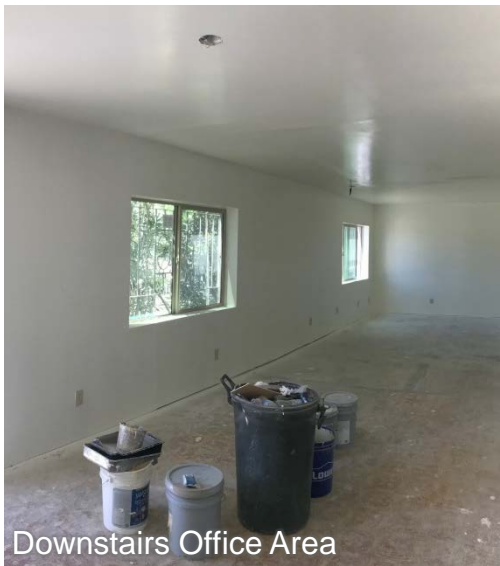
Downstairs Office Area