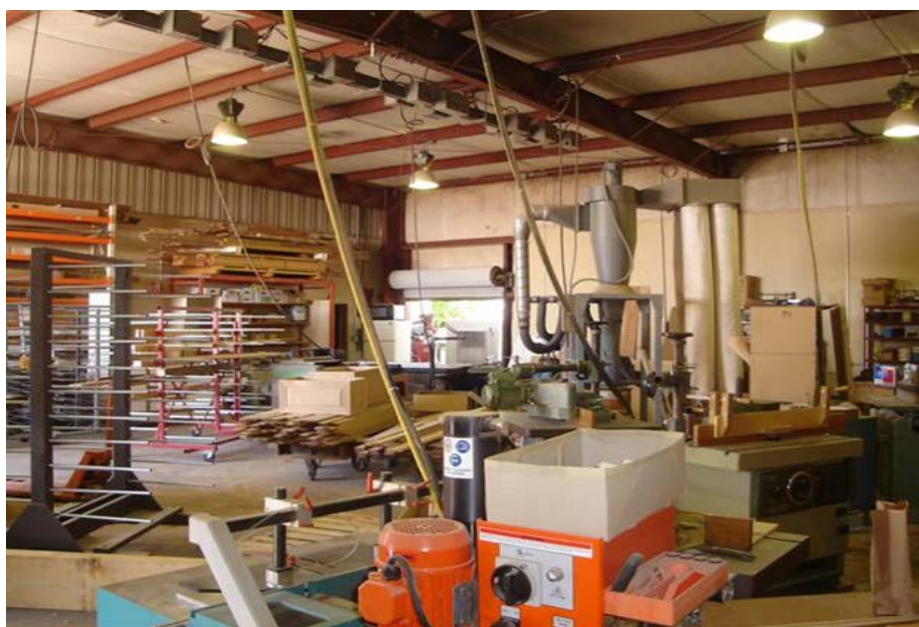
Rear Shop Area

Paul Hooker Principal, Industrial Properties +1 520 546 2704 phooker@picor.com