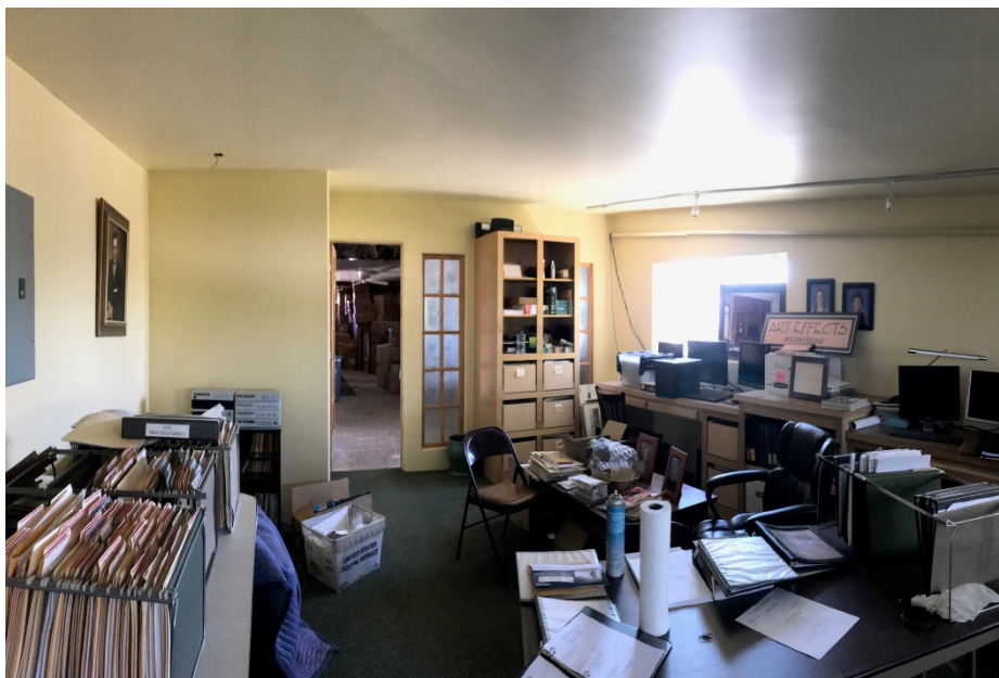
Upstairs Office Area