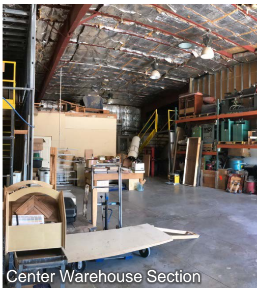
Center Warehouse Section