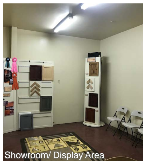
Showroom/ Display Area

Paul Hooker Principal, Industrial Properties +1 520 546 2704 phooker@picor.com