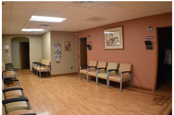
2 nd Waiting Area