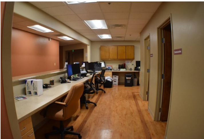
Patient Check-In/ Check-Out