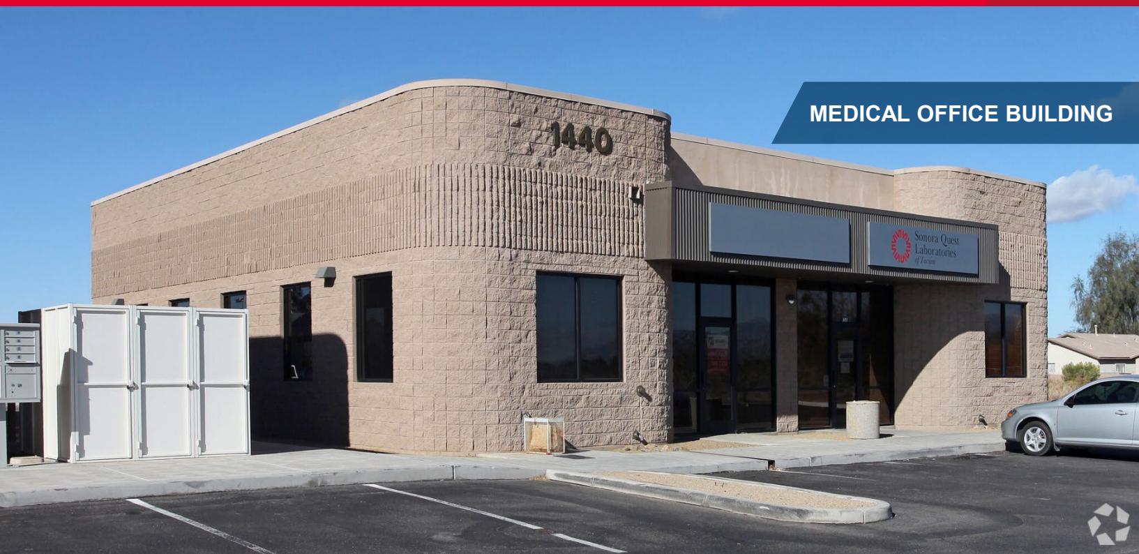
MEDICAL OFFICE BUILDING

1,222 SF Available Lease Rate: $22.00/SF, NNN