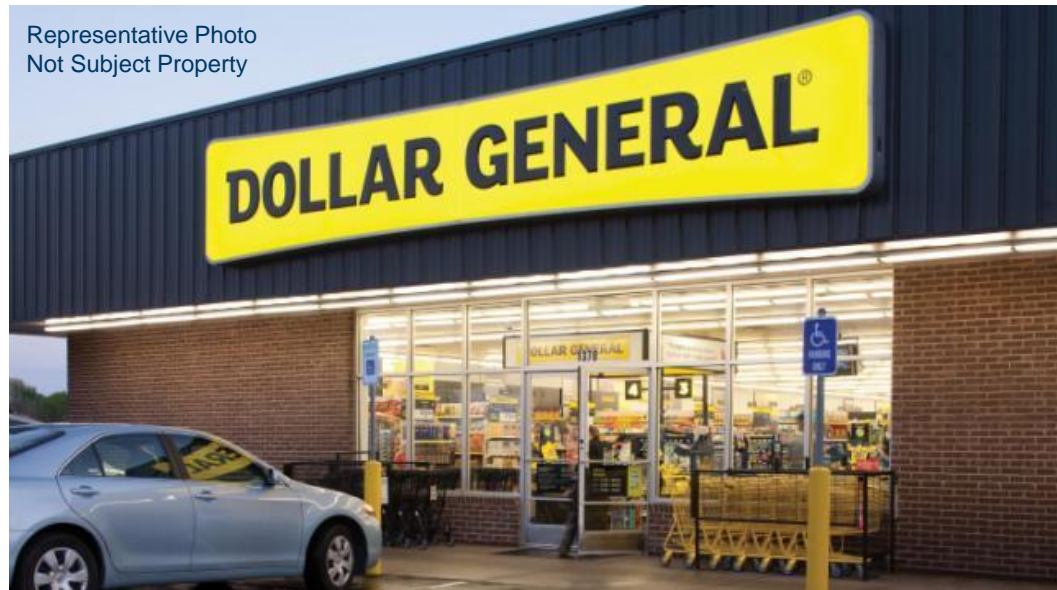
Representative Photo Not Subject Property