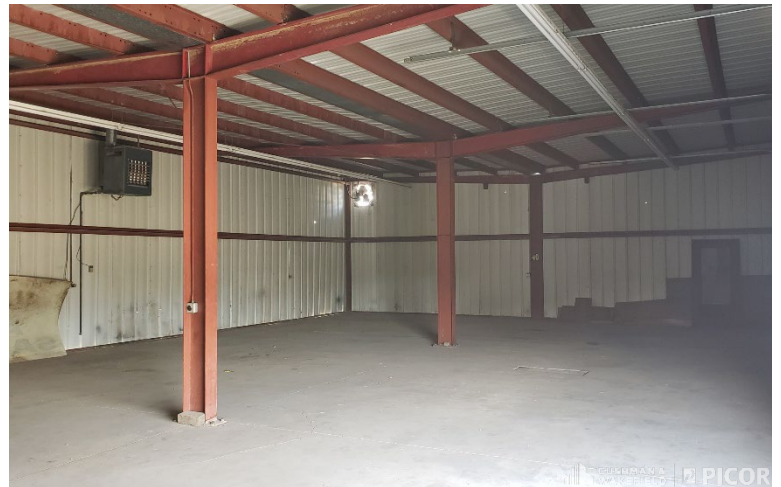
West Shop Interior

Paul Hooker, SIOR Principal, Industrial Properties +1 520 546 2704 phooker@picor.com