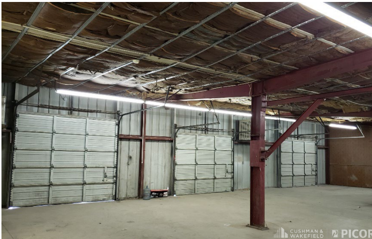
East Shop Interior