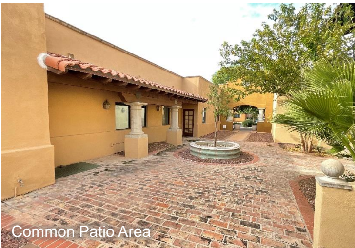
Common Patio Area