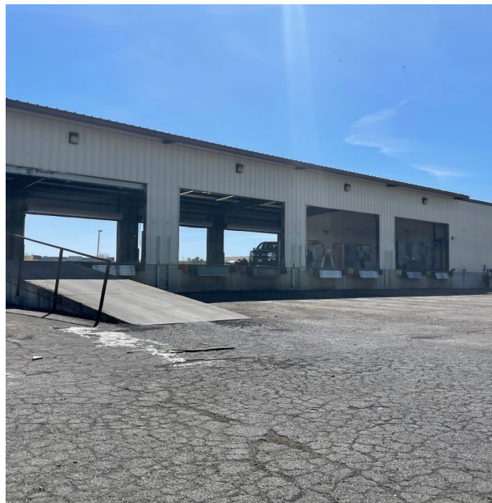
Dock & Ramp Loading