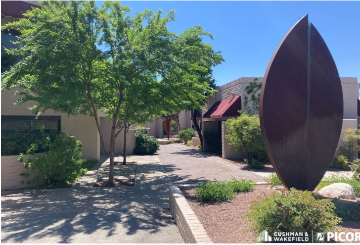
Office Plaza Entrance