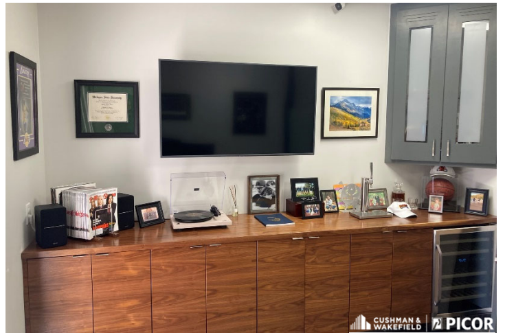
Executive Office Display and Storage