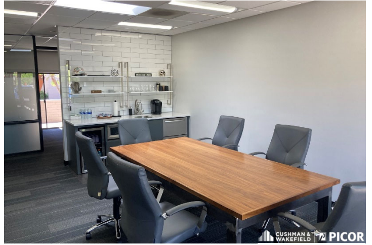
Conference Area & Kitchenette