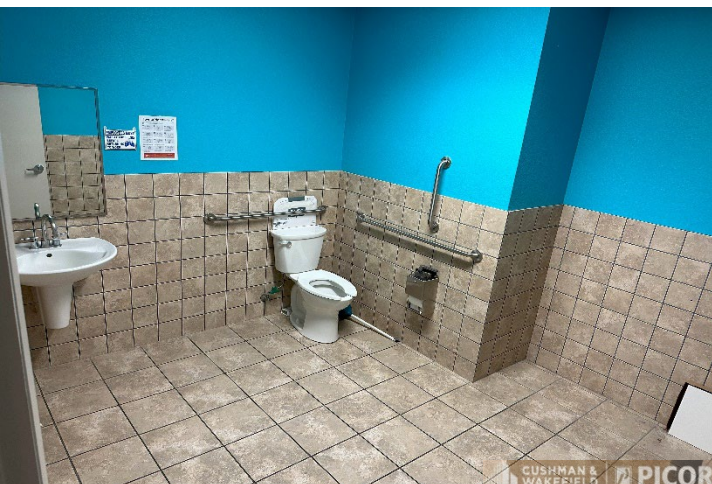
ADA Compliant Restroom