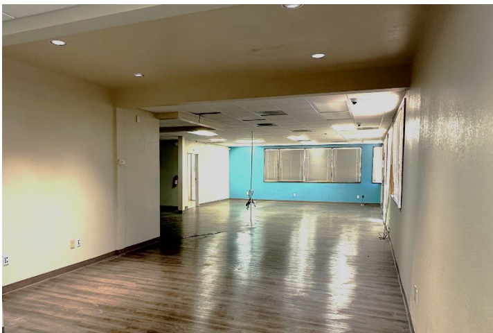
Open Workspace & Common Area