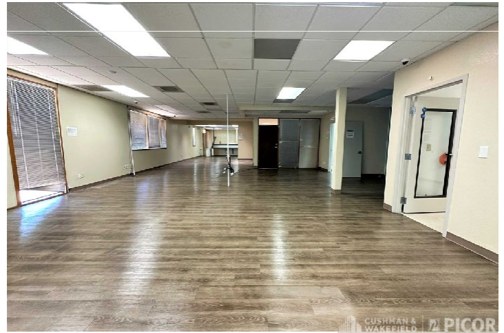
Open Workspace & Common Area