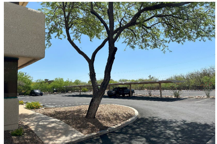
South Parking Lot