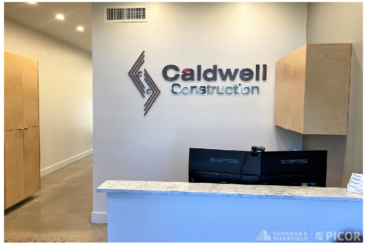
Entry Lobby & Reception