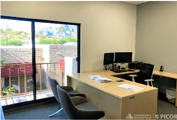
Upstairs Executive Office