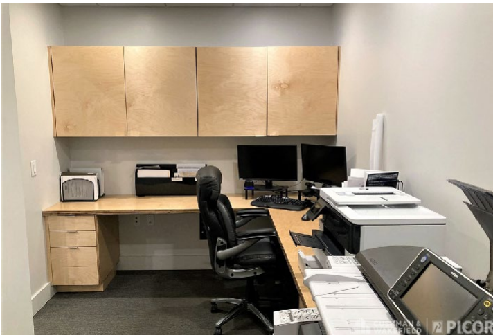
Downstairs Office and Copy Area