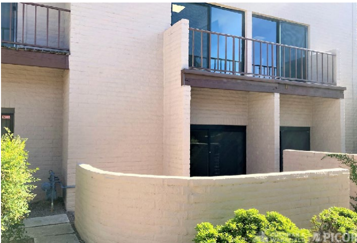
Private Patio and Balcony