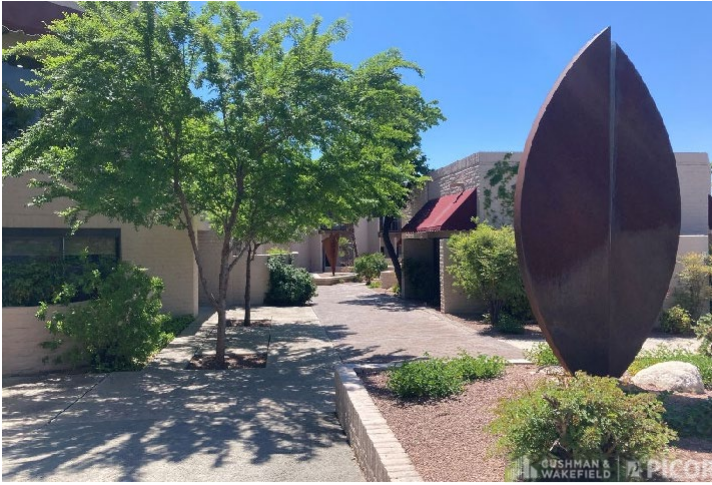
Office Plaza Entrance