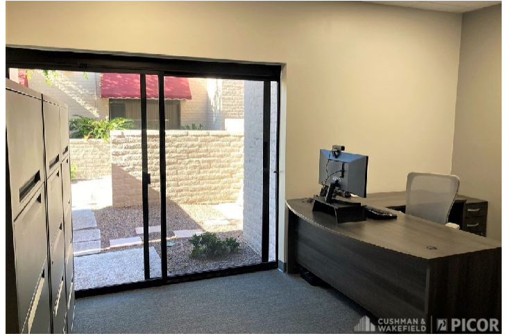
Downstairs Executive Office