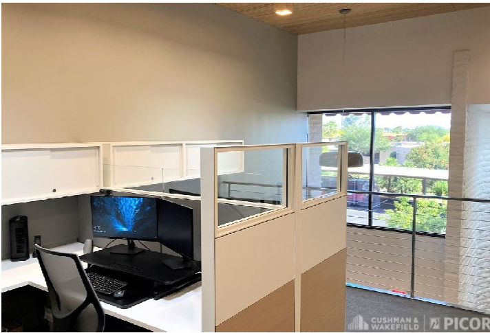
Upstairs Open Office Area