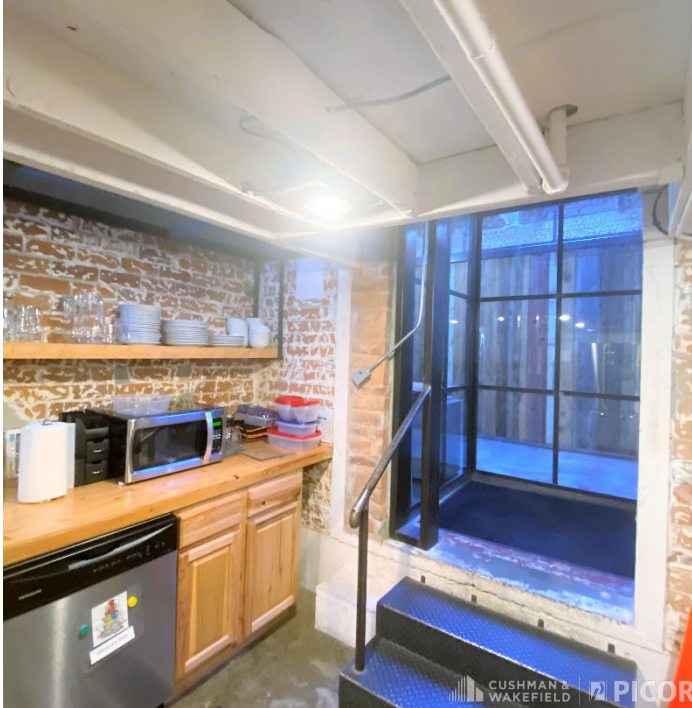
Entrance to Suite