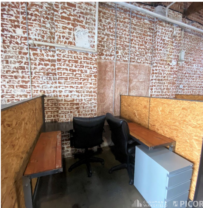
Desk or Workspace