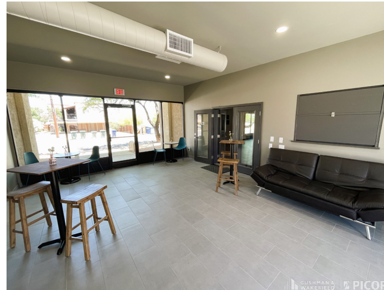
Ground Floor Property Photos