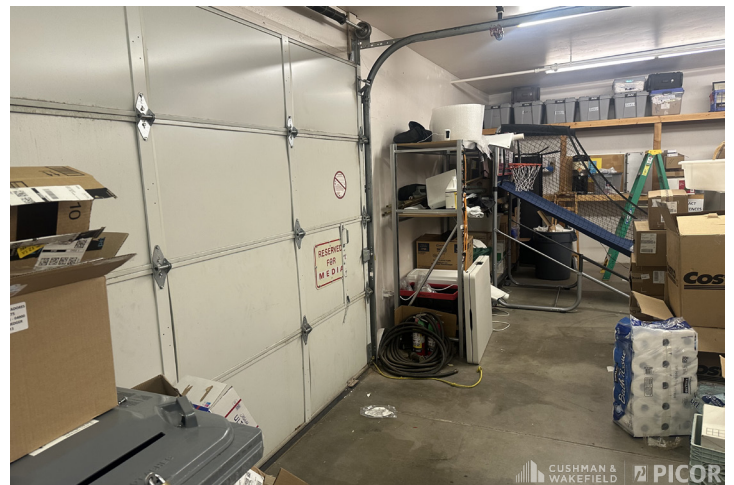
Roll Up Door

Independently Owned and Operated / A Member of the Cushman & Wakefield Alliance