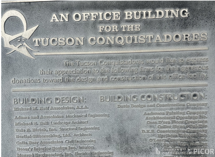
Building Plaque for the Tucson Conquistadores