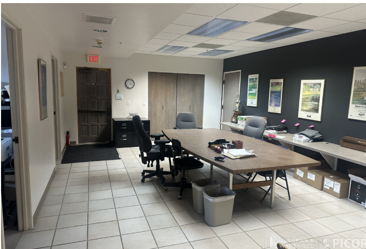
Conference Room 2