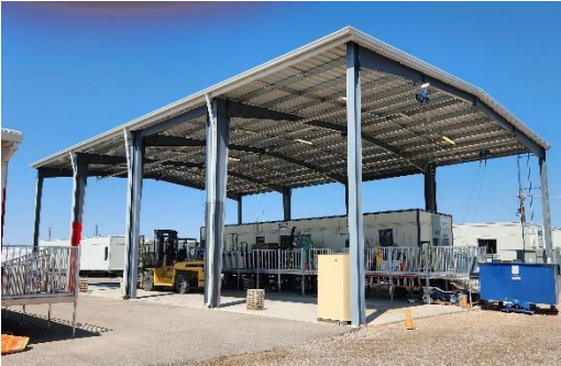
Covered workspace (canopy to remain; modular building not included)