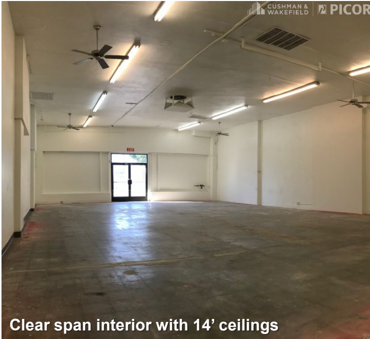
Clear span interior with 14' ceilings