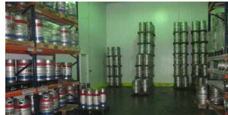
DRAUGHT HOUSE (KEG STORAGE)