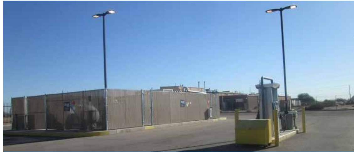
CNG FUELING STATION