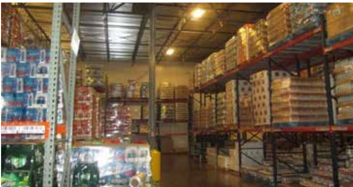
BOTTLE WAREHOUSE (NOT REFRIGERATED)