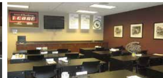
SALES AREA DOCK DOOR